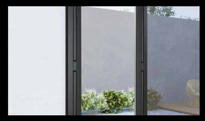
Screen and blind combination configuration

To see the full range of specifications for the S4 System, visit centor.com.