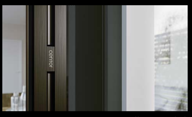
Narrow screen jamb

To see the full range of specifications for the S2 Screen, visit centor.com.