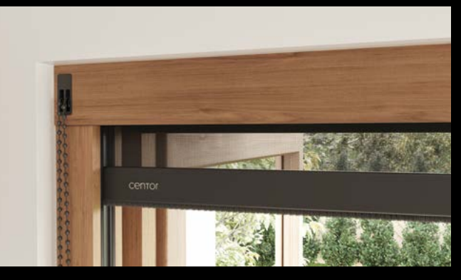
Solid timber frame

S5 is complete with durable timber cladding which adds warmth and luxury to your home. To see the full range of specifications for the S5 Screen, visit centor.com.