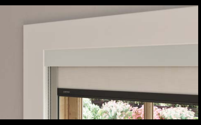
Slim aluminium frame allows for face mounting to window

Constructed from durable aluminium, S6 can be powdercoated in any colour of your choice to suit your home. To see the full range of specifications for the S6 Screen, visit centor.com.