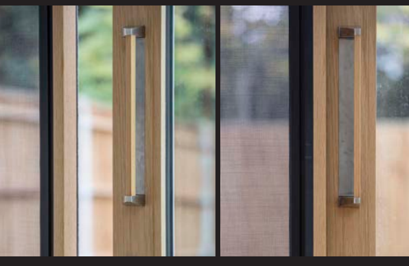
Interior sliding handle

To see the full range of specifications for Sliding Doors, visit centor.com.