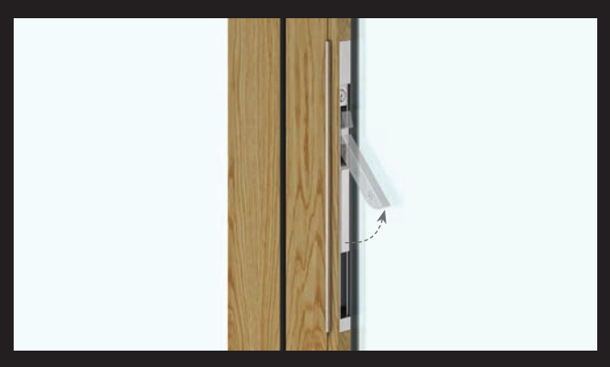
Access Autolatch™ interior lever and signifier

To see the full range of specifications for Folding Doors, visit centor.com.