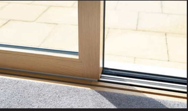
Sliding panel aligns with the mullion