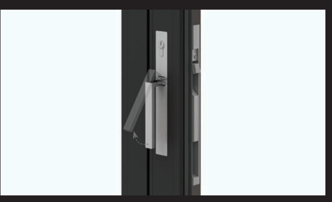
Access Autolatch™ exterior pull-handle