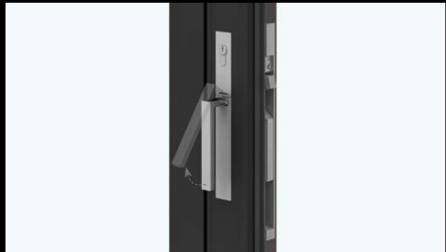
Access Autolatch™ exterior pull-handle