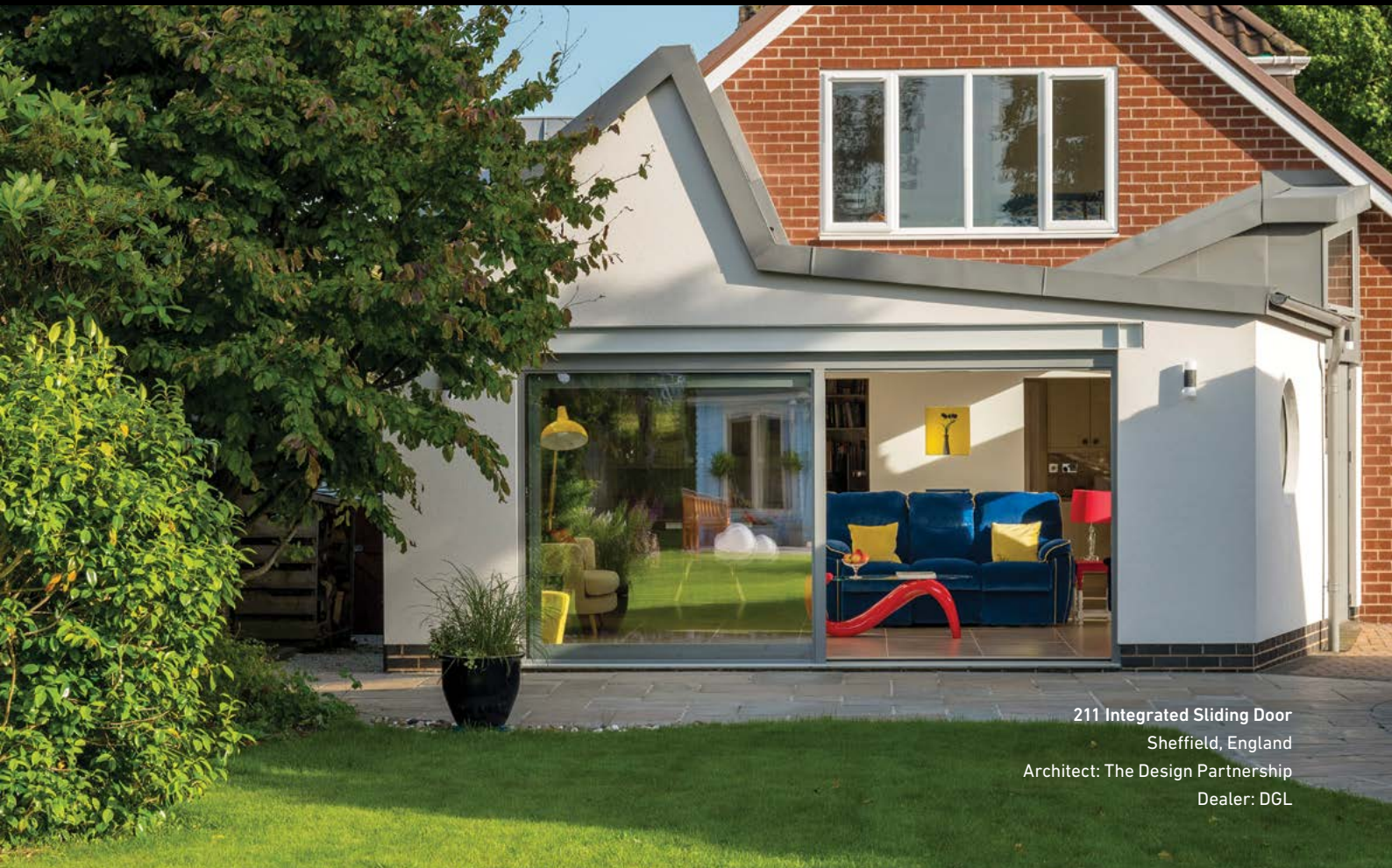
211 Integrated Sliding Door Sheffield, England Architect: The Design Partnership Dealer: DGL