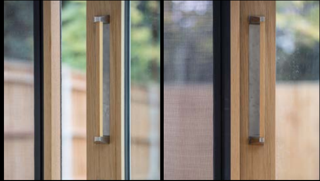
Interior sliding handle

To see the full range of specifications for Sliding Doors, visit centor.com .