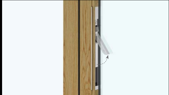
Access Autolatch™ interior lever and signifier

To see the full range of specifications for Folding Doors, visit centor.com .