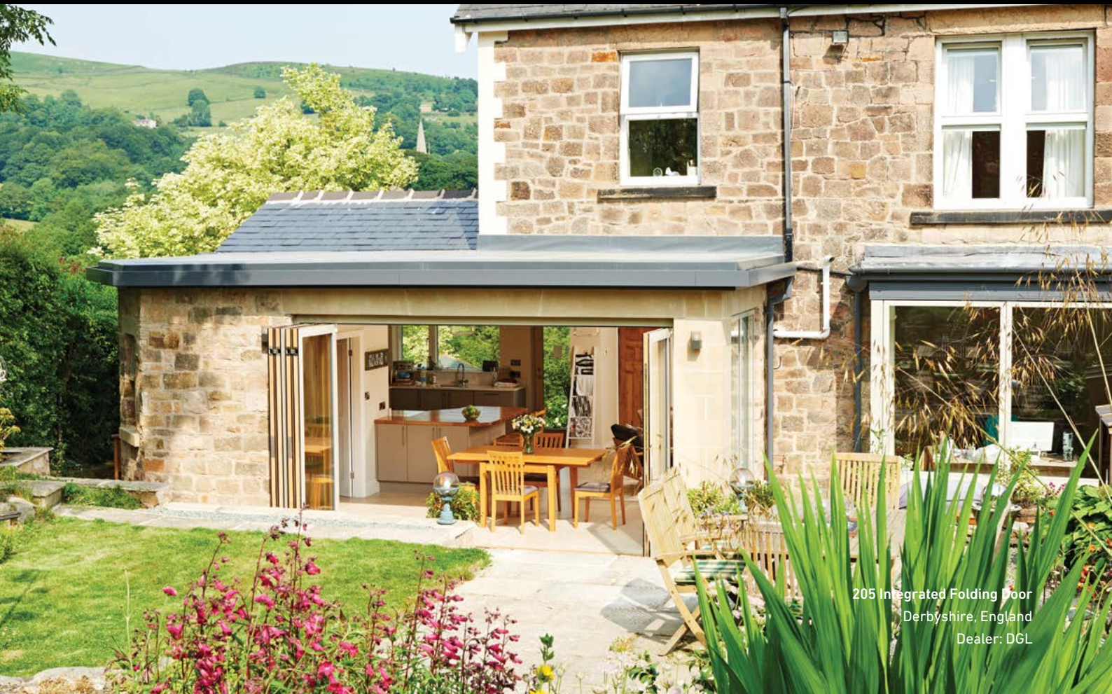
205 Integrated Folding Door Derbyshire, England Dealer: DGL