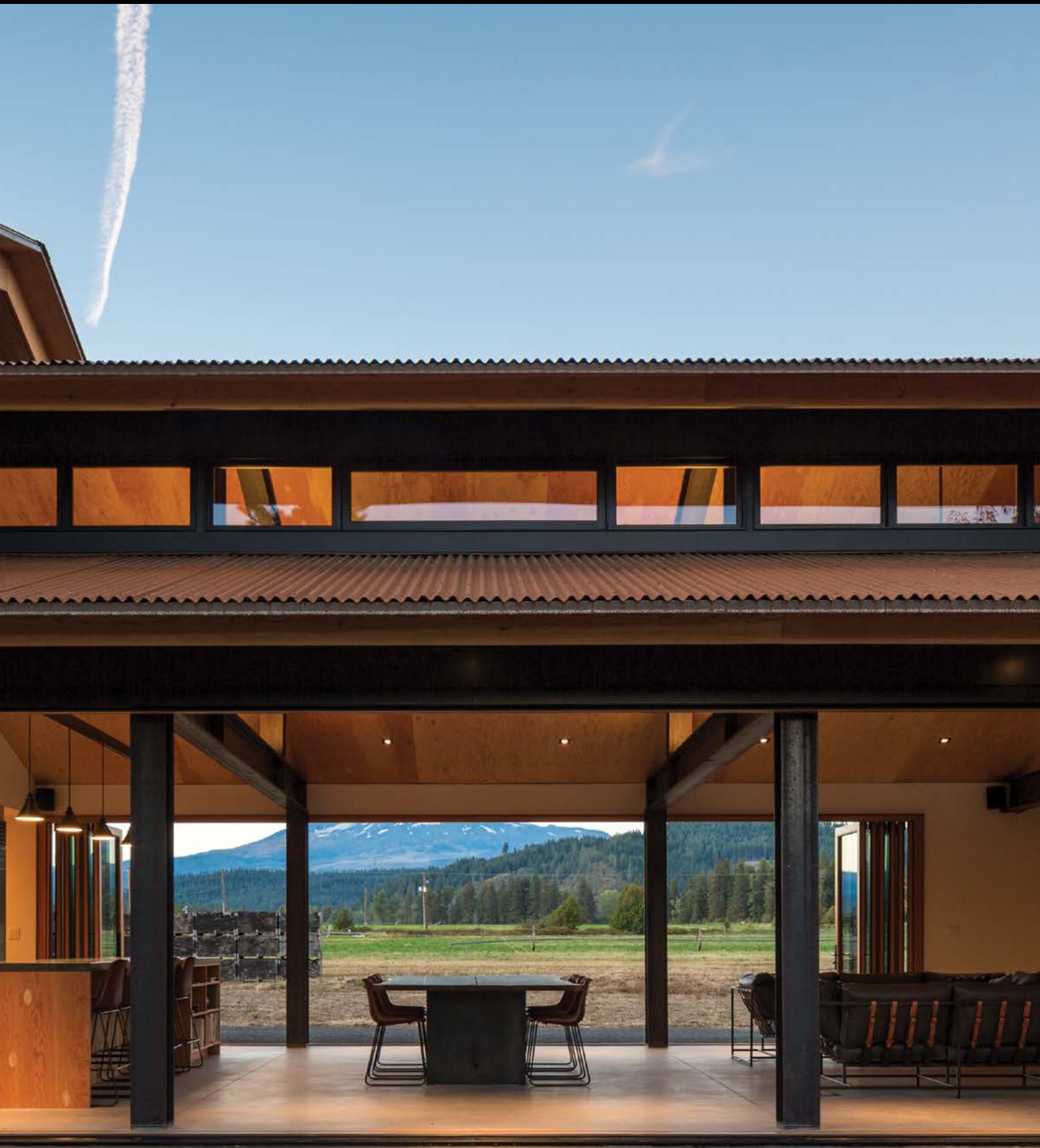
205 Integrated Folding Doors Trout Lake, USA Architect: Olson Kundig Dealer: Glacier Window & Door