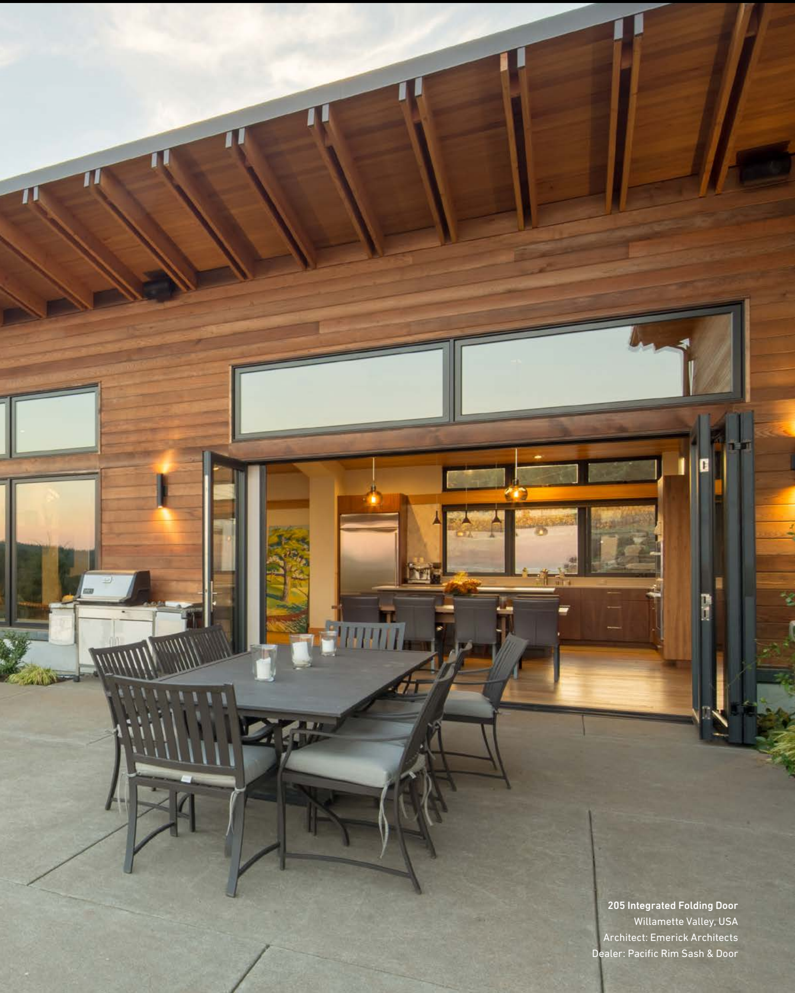
205 Integrated Folding Door Willamette Valley, USA Architect: Emerick Architects Dealer: Pacific Rim Sash & Door