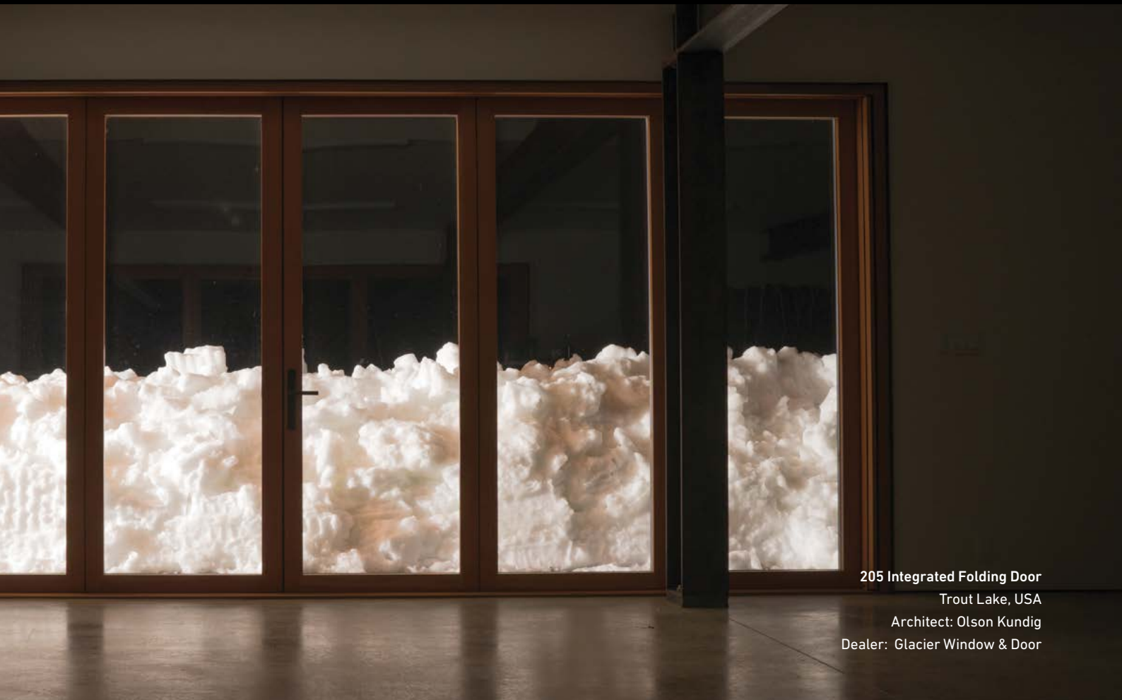
205 Integrated Folding Door Trout Lake, USA Architect: Olson Kundig Dealer: Glacier Window & Door