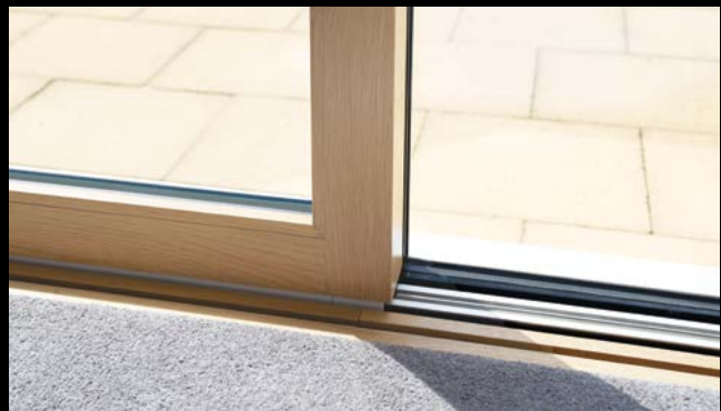
Sliding panel aligns with the mullion