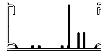
SECTION B-B SCALE 1 : 2